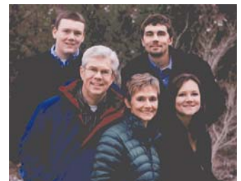
Sen. Mike Cooney D-Helena

The direction of our state can swing in dramatically different directions on the power of one vote. I admire anyone willing to run for office at any level, as our government will always only be as good as the quality of the people that comprise that government.